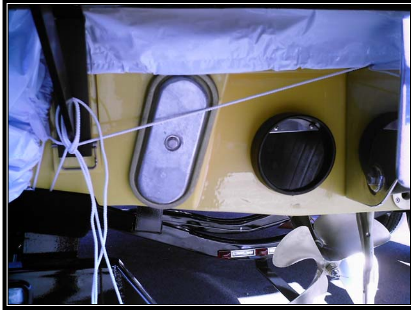
Boat shown with Power Wedge