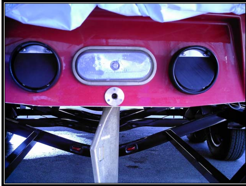
Shown without wedge

All anodes need to be hardwired to ground