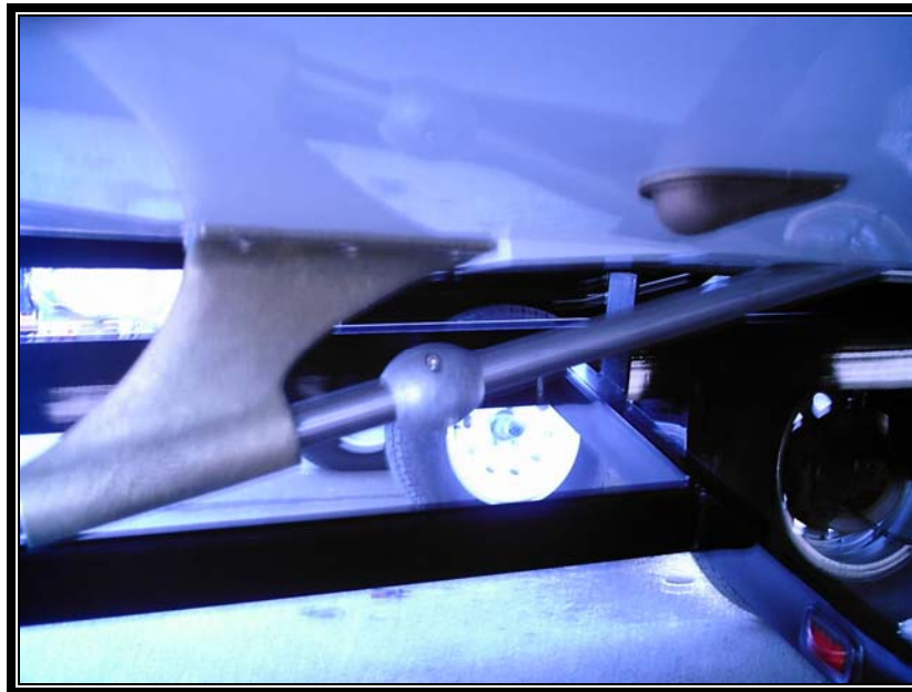
Shown with Propshaft Collar